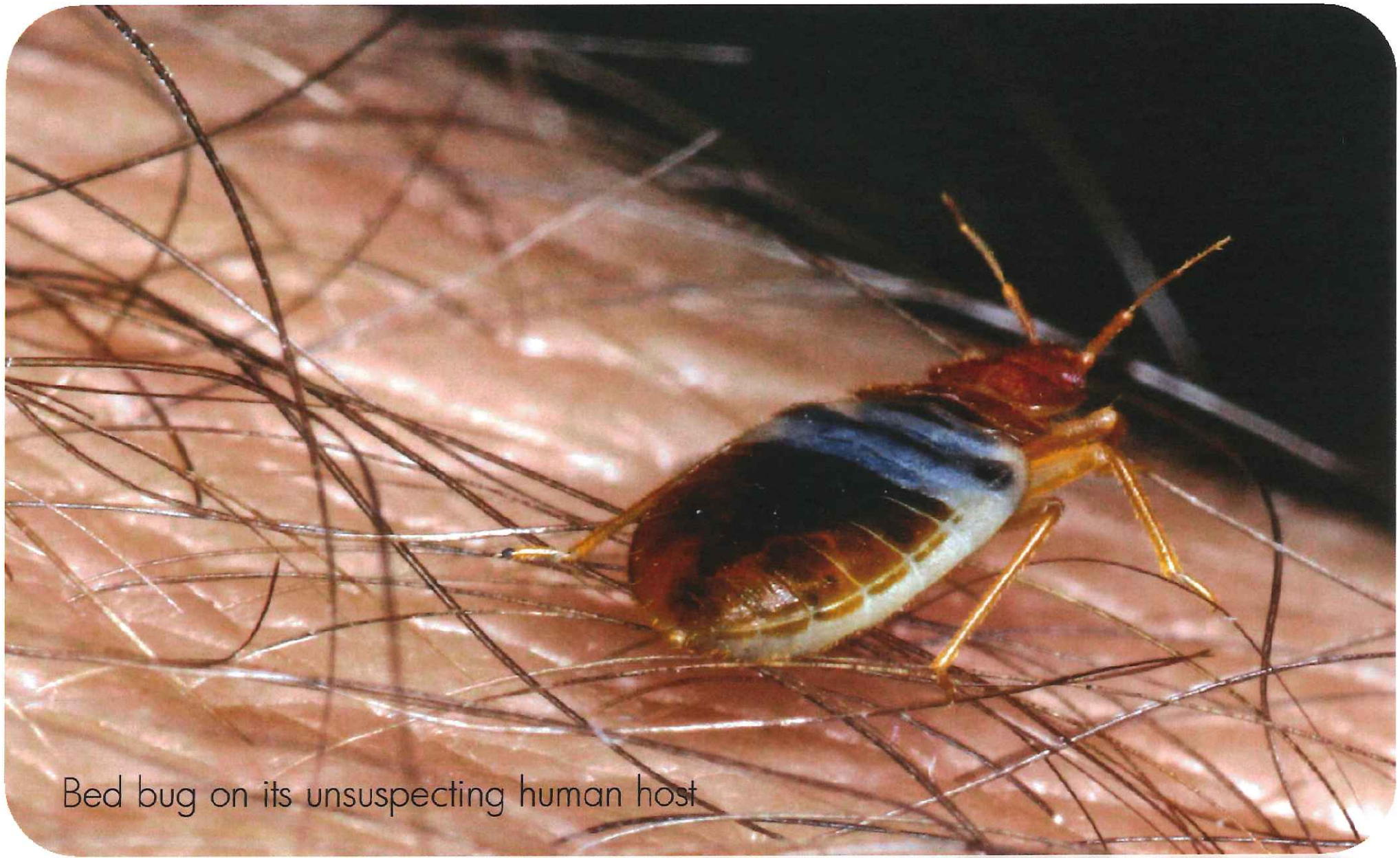
Bed bug on its unsuspecting human host