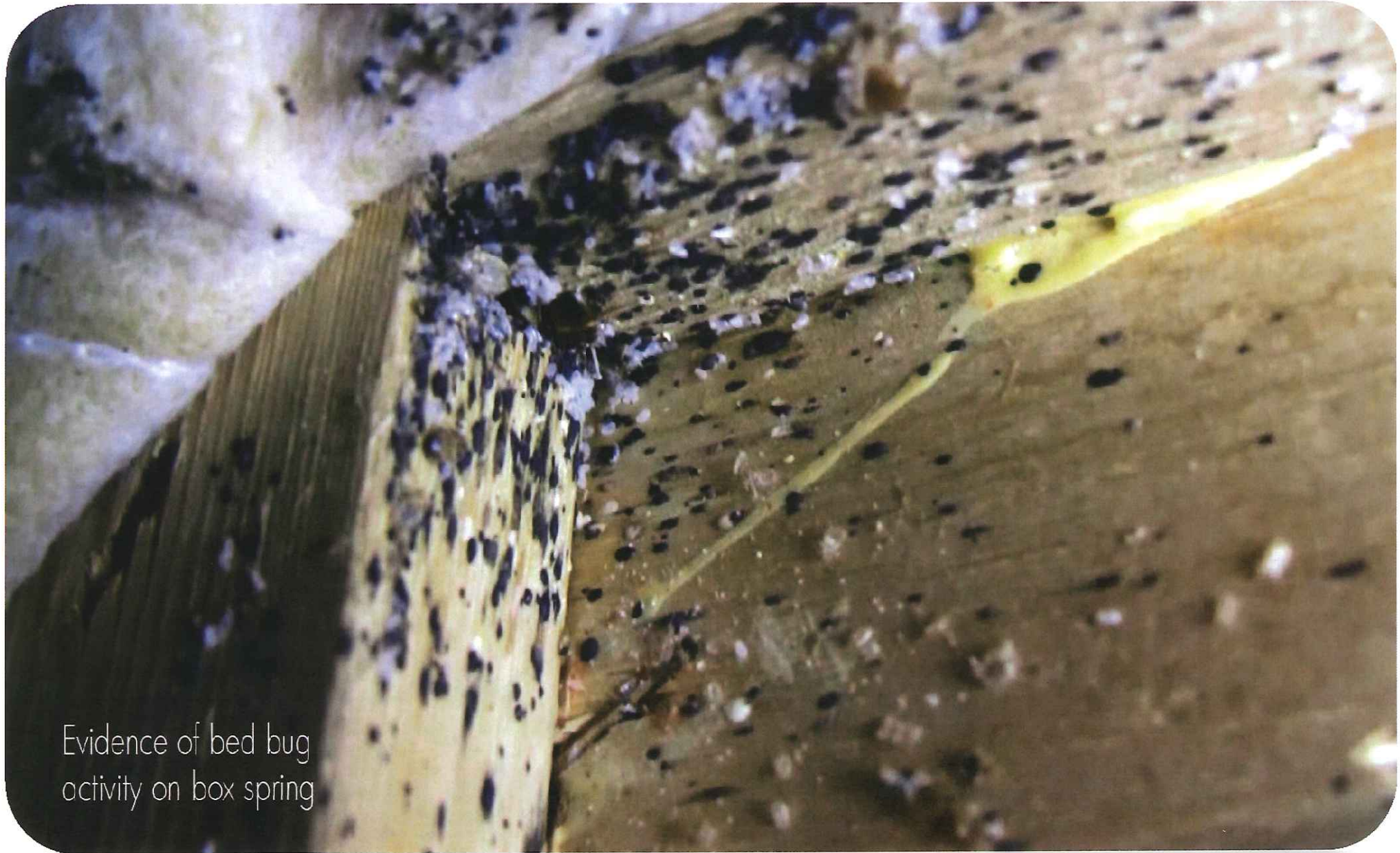
Evidence of bed bug activity on box spring