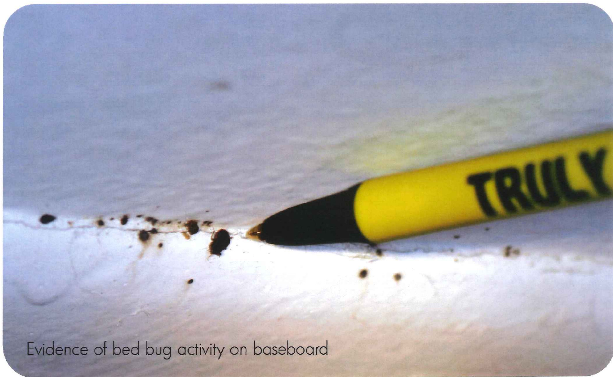
Evidence of bed bug activity on baseboard