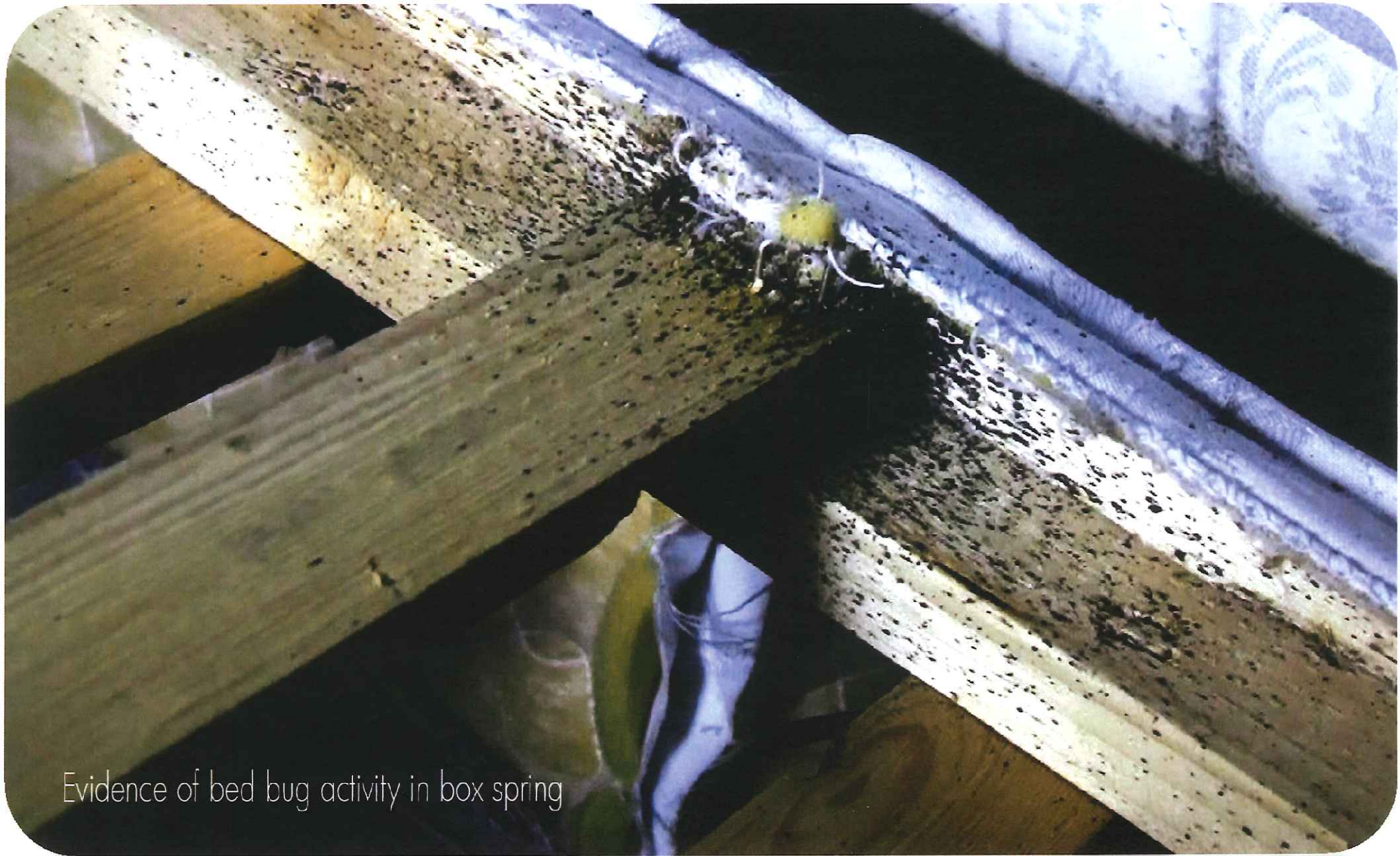
Evidence of bed bug activity in box spring