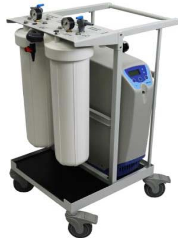
Cart w/ duplex carbon block arrangement